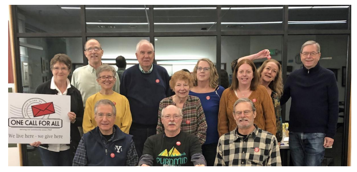
"Ask Us Where We Give!" Bainbridge Public Library Board of Directors

You can also give online at <u>www.onecallforall.org</u>.